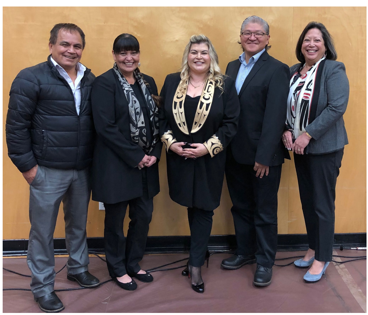
COMMISSIONERS AT THE FIRST NATIONS SUMMIT MEETING IN OCTOBER 2019

Independence provides the Treaty Commission with the authority to ensure fair and impartial negotiations, which are essential to reconciliation.