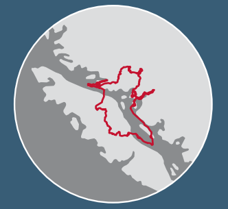
Wei Wai Kum and Kwiakah

Wei Wai Kum First Nation/Kwiakah First Nation Transition to Stage 5 and Treaty Revitalization Agreement